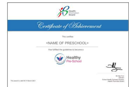
Diagram 2: Certificate of Achievement for Healthy Pre-school with validity period of two years (For Platinum Tier only)