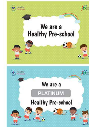
Diagram 1: Healthy Pre-school (For both Basic and Platinum Tiers)